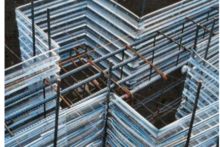
Pile Cap Blind Side Wall Grade Beam